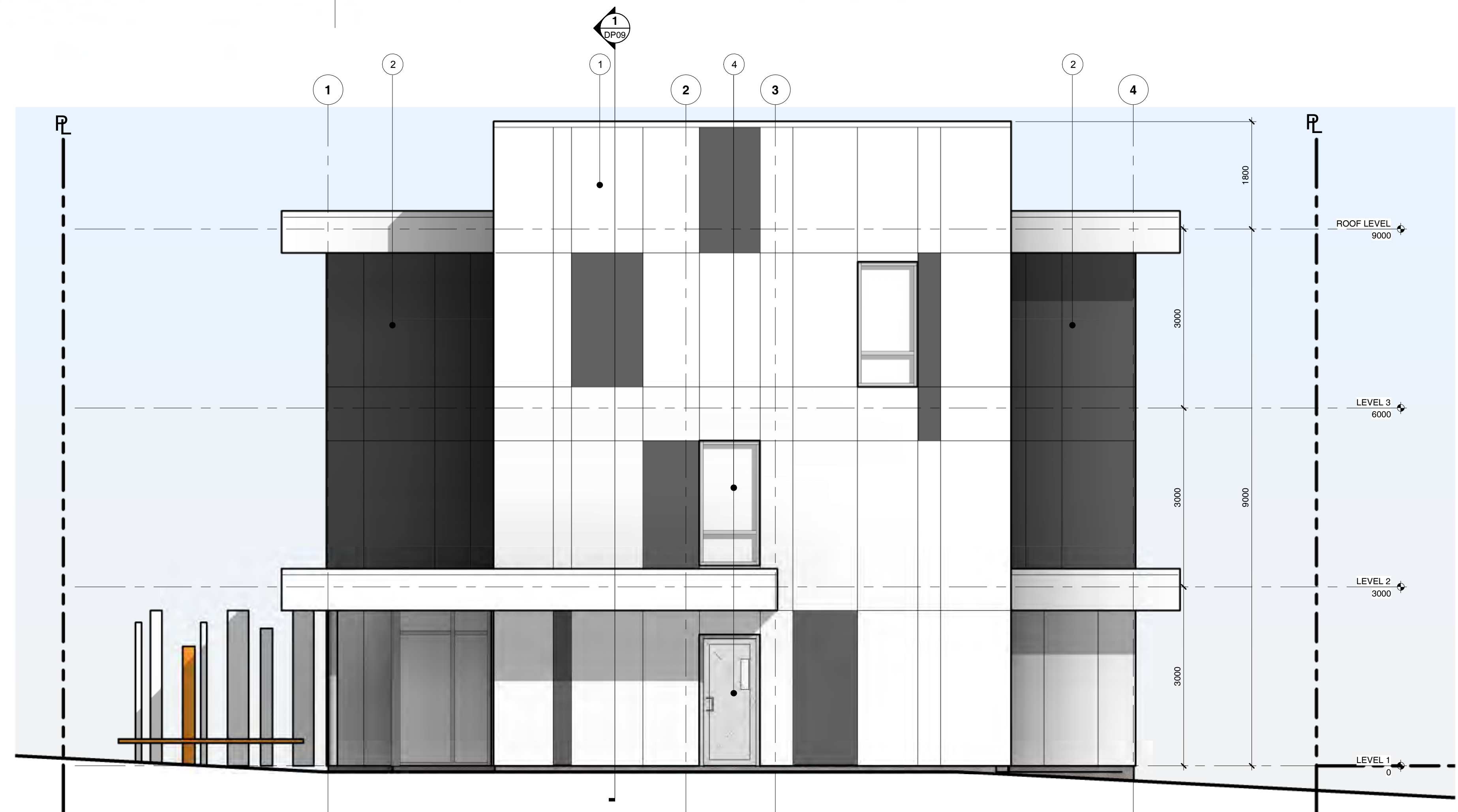
2 WEST ELEVATION DP07 1:50