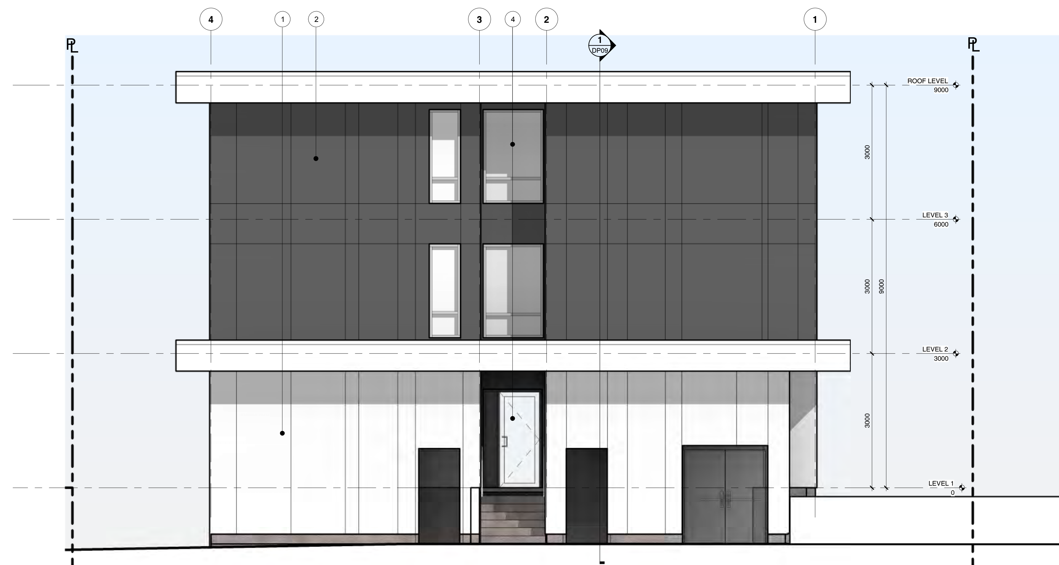
2 DP08 1:50 EAST ELEVATION