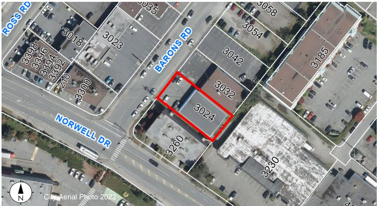
City Aerial Photo 2022