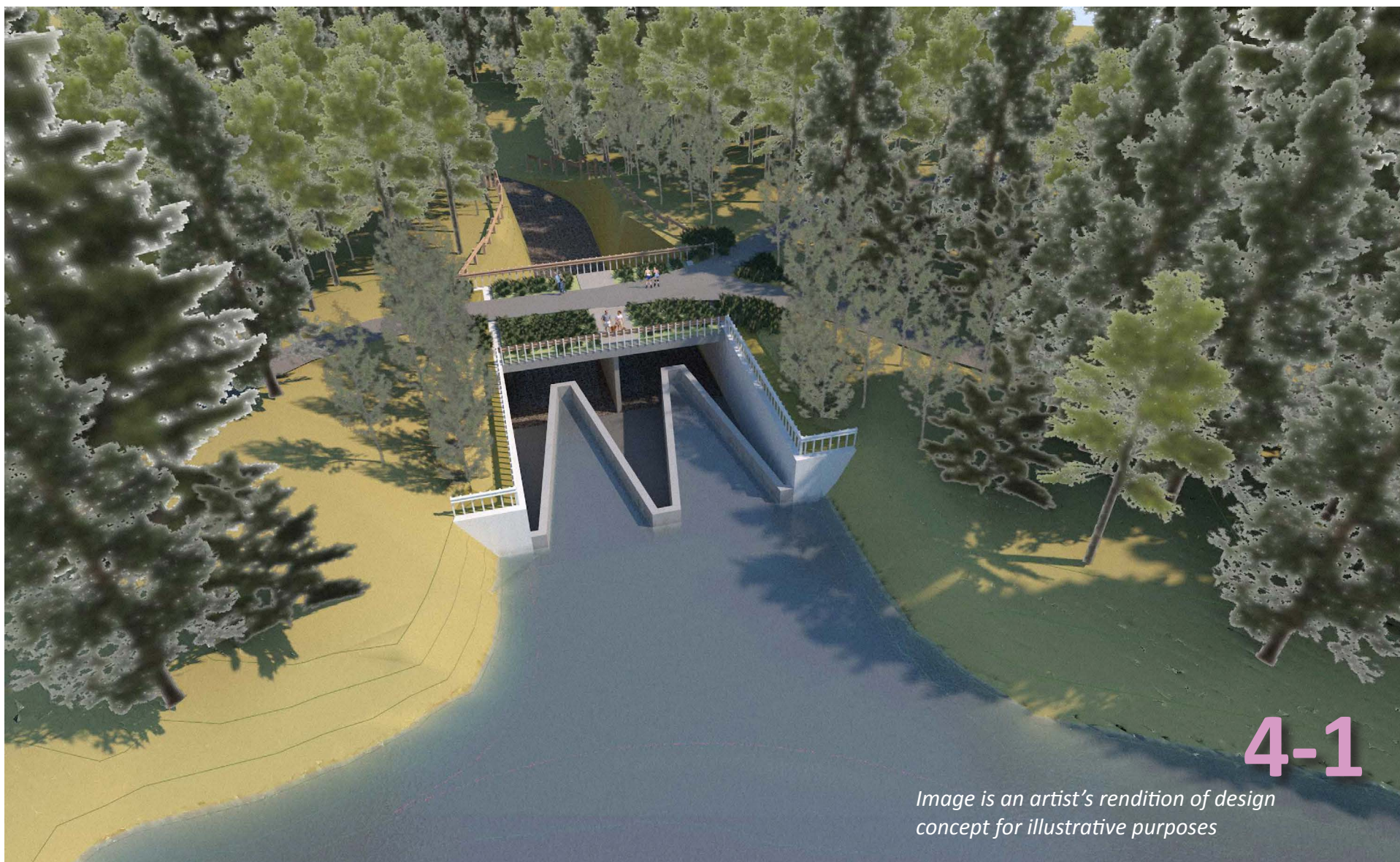
Auxiliary Spillway to Harewood Creek - Anchored Channel Option 1 Aerial view from the north