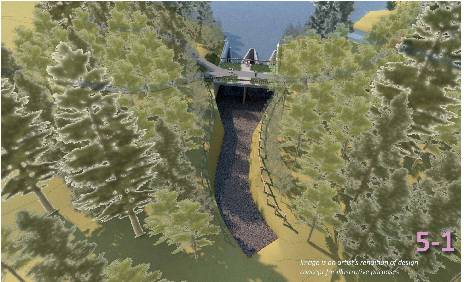
Auxiliary Spillway to Harewood Creek - Anchored Channel Option 1 Aerial view from the south