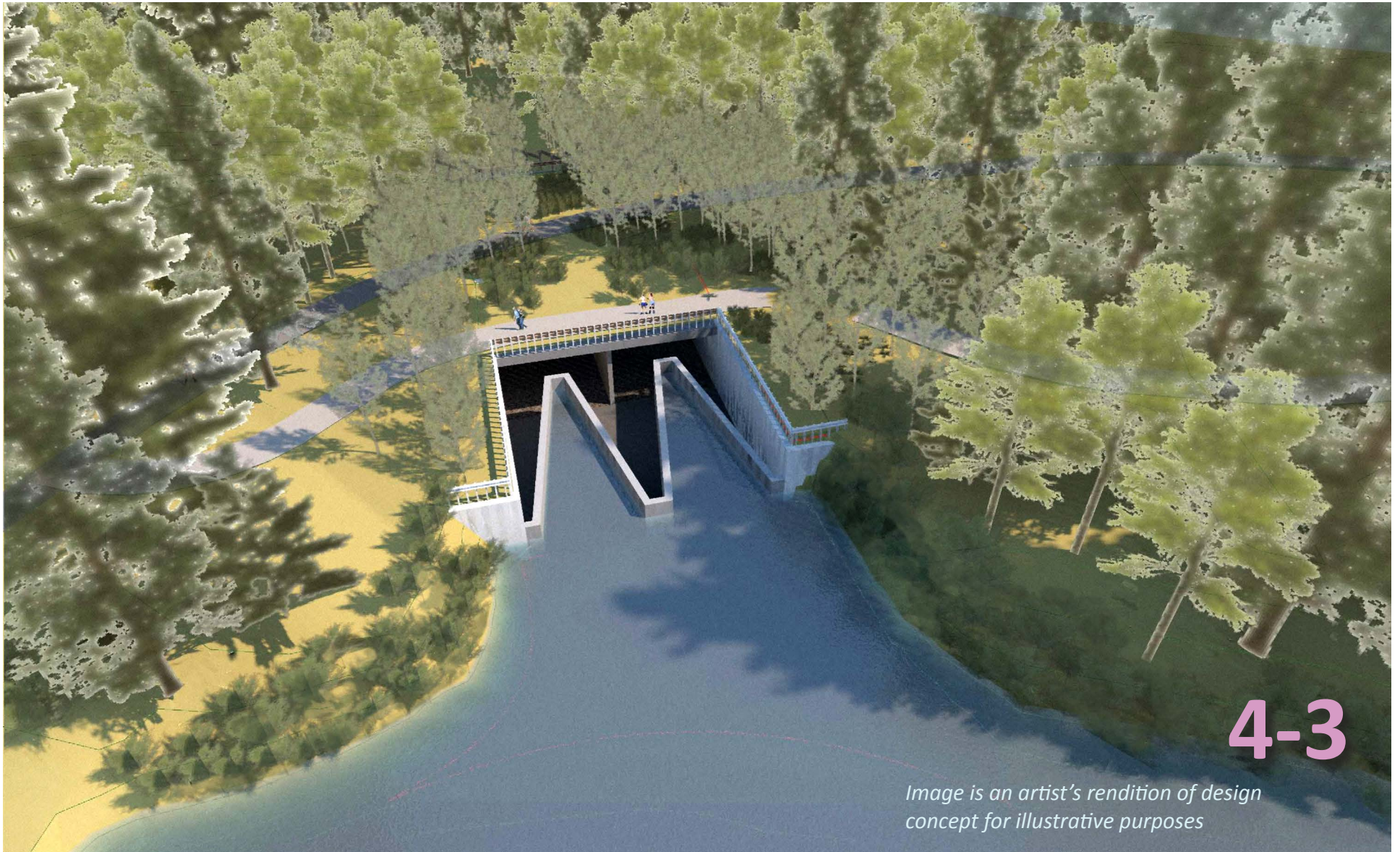
Auxiliary Spillway to Harewood Creek - Labyrinth / Box Culvert Cut and Cover Option 3 Aerial view from the north