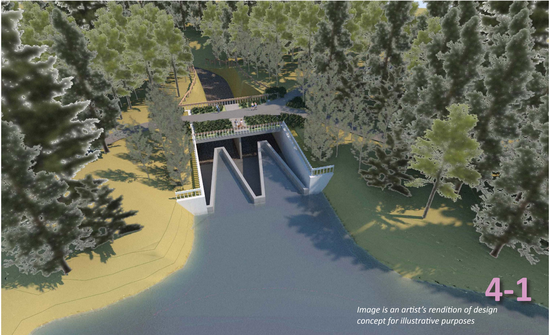
Auxiliary Spillway to Harewood Creek - Anchored Channel Option 1 Aerial view from the north