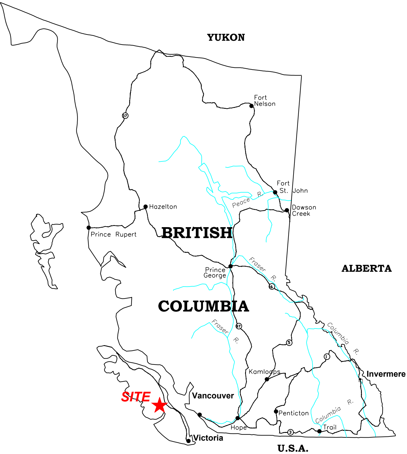
KEY PLAN NOT TO SCALE