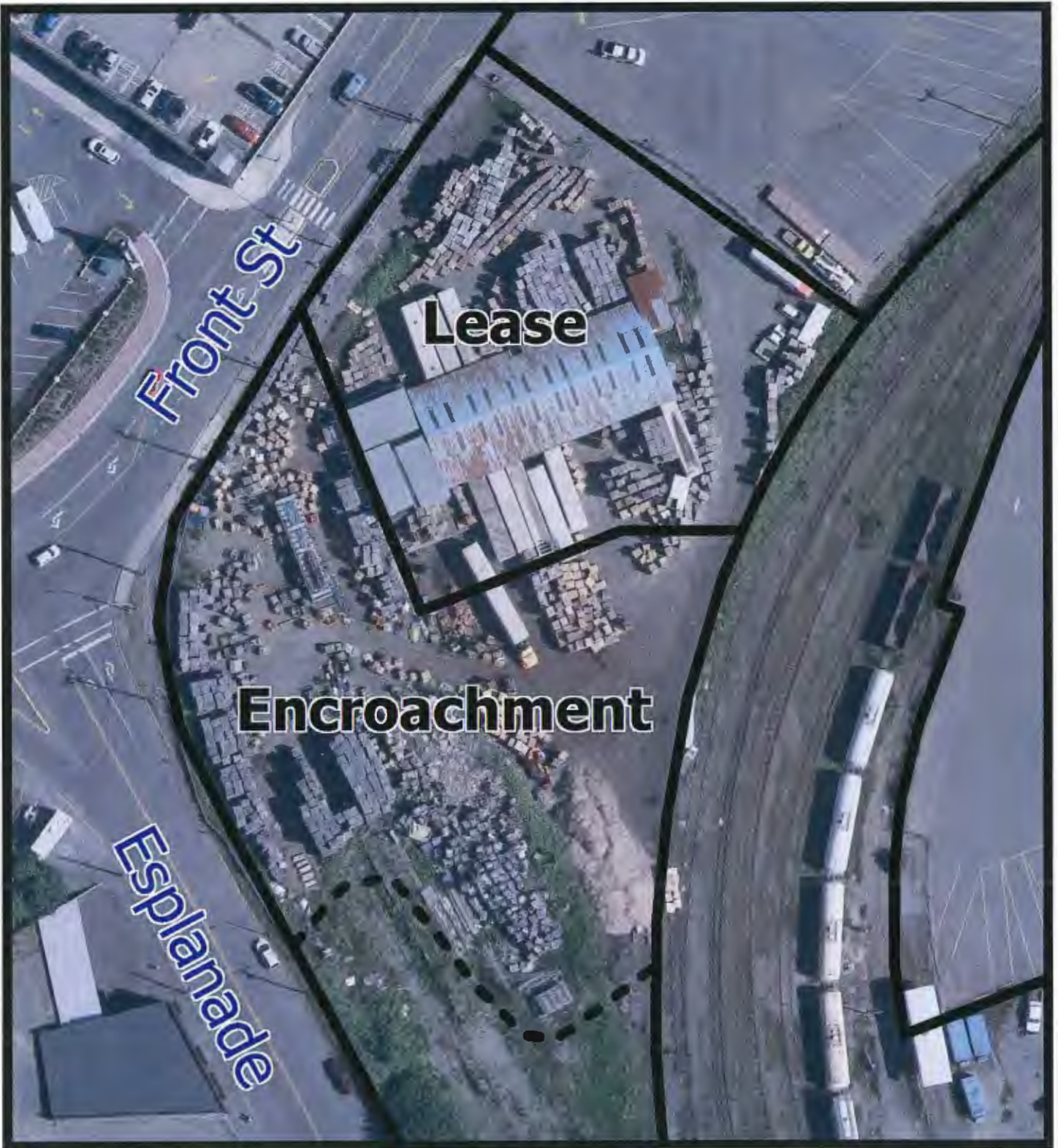
Island Pallet Solutions Ltd. Lease Area and Encroachment