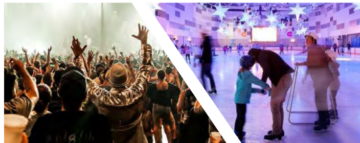
The proposed events centre would anchor the South Downtown Waterfront walkway area and draw visitors to the city.