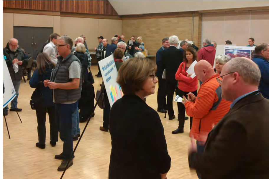
Residents attended open houses in November and December 2016 to learn more about the proposed events centre.

For more info about the referendum, visit www.nanaimo.ca/eventscentre .