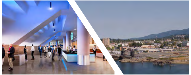
Council has identified 1 Port Drive on the waterfront in downtown Nanaimo as the preferred site for a proposed events centre.