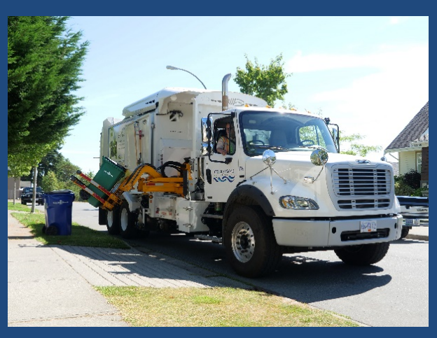
Automated garbage truck