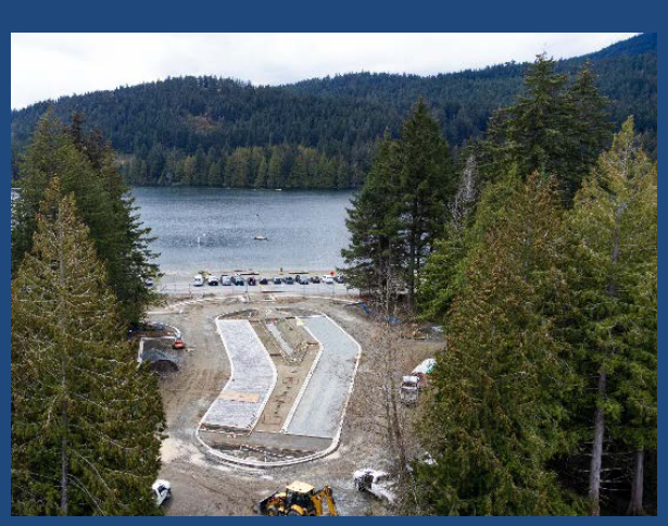
Westwood Lake Park improvements