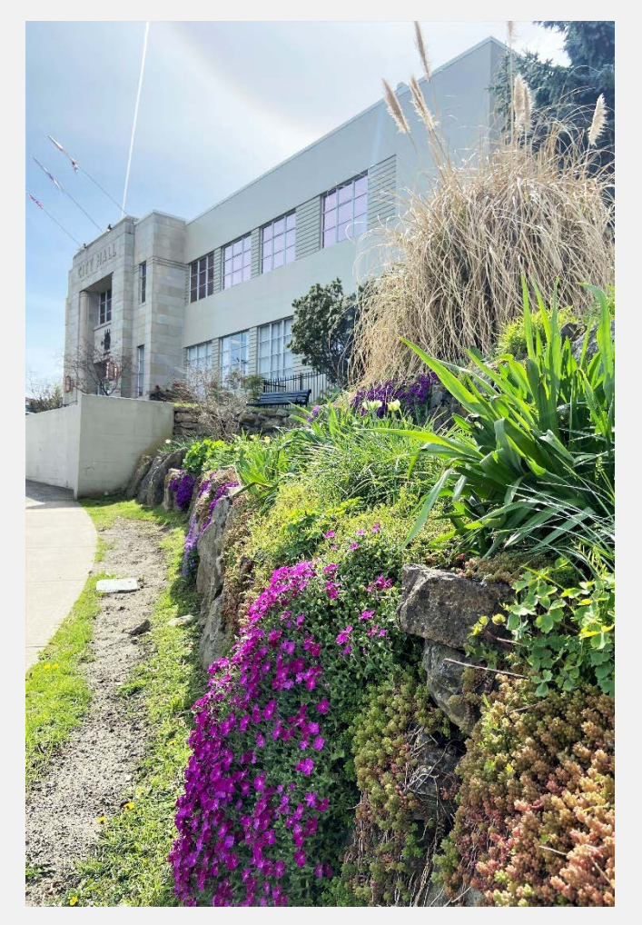
Nanaimo City Hall