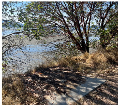
Jack Point and Biggs Park