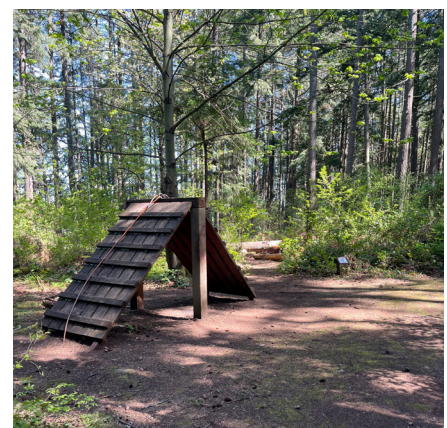
Beban Recreation Park