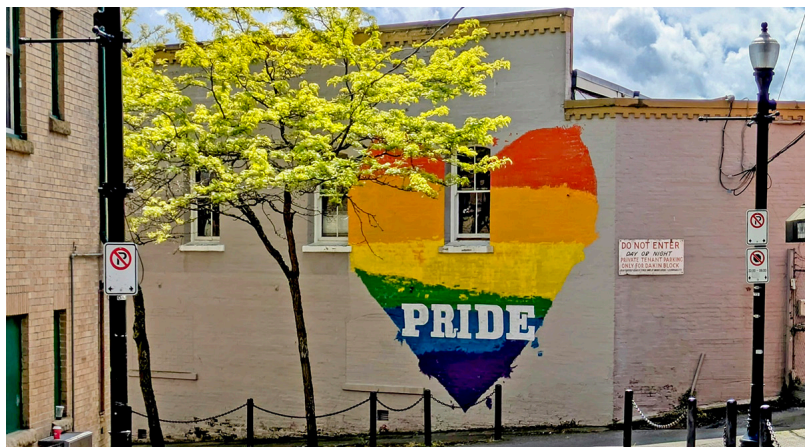
Humanity in Art, 'Big Heart' Pride Mural, 2025