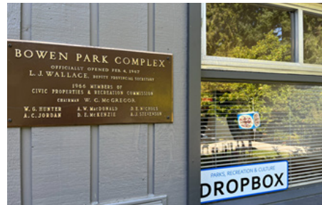
Lower Bowen Complex DropBox

Your Name Urban Design Roster City of Nanaimo Culture and Events