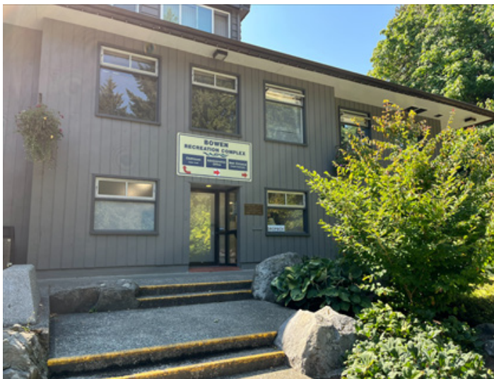
Lower Bowen Complex

Should you experience challenges or barriers in this application process or require additional support, we encourage you to reach out to: cultureandevents@nanaimo.ca (250-755-4483).