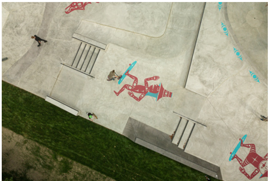
Xwyunumus, Joel Good & Bracken Hanuse Corlett, 2020