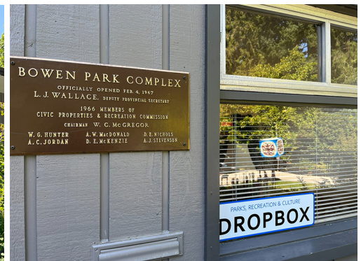
Bowen Complex Drop-Box (500 Bowen Rd, Nanaimo, BC)

Should you experience challenges or barriers in this application process or require additional support, we encourage you to reach out to: