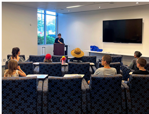
Youth Poetry Reading, August 2024

Note: Bookable meeting space/ working space at the Vancouver Island Regional Library (Harbourfront) will be available to the Youth Poet Laureate.