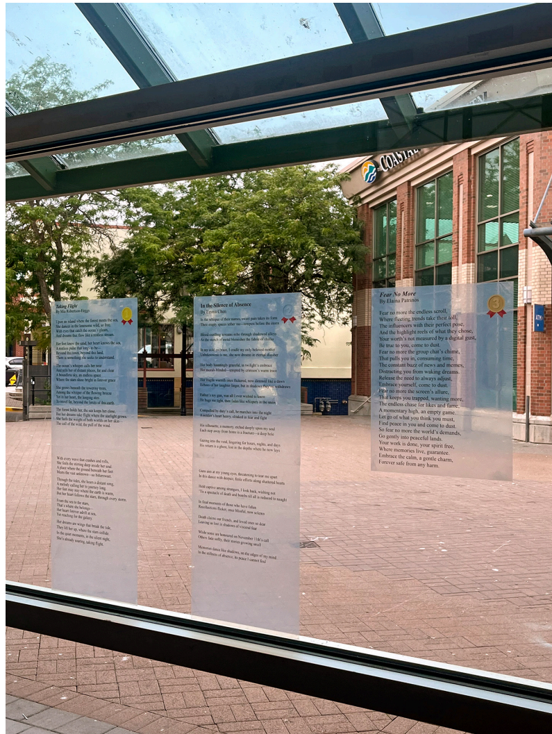
Youth Poetry Competition Display (2025)

Questions regarding the Youth Poet Laureate Program may be directed to Culture & Events at cultureandevents@nanaimo.ca , ATTN: Youth Poet Laureate Program or 250-755-4483.