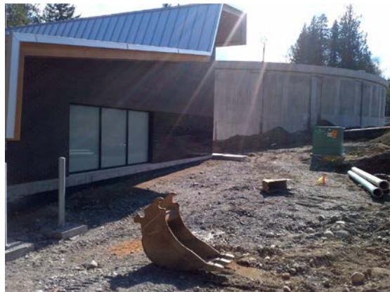
construction of the new energy recovery building and drinking water storage tank - April 1, 2014

In January 2012, the City received notification of Federal funding under the Canada Gas Tax Fund towards the building of a new energy recovery building and an enclosed concrete water storage tank. The new 14 million litre drinking water storage tank replaces the existing open reservoir and improves treated water quality. Construction on this new tank commenced in March 2013 and was completed May 2014. Almost complete this facility provides storage for treated drinking water for just over 30% of the City residents covering an area from downtown to south Nanaimo and incorporates Snuneymuxw Reserves Nos. 1 and 2. The new tank will receive clean potable water from the new South Fork Water Treatment Plant in 2015.