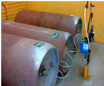
chlorine tanks at Water Process Centre

The water is disinfected using chlorine at facilities located at Water Process Centre in South West Extension and the City of Nanaimo's Reservoir No.1 site.