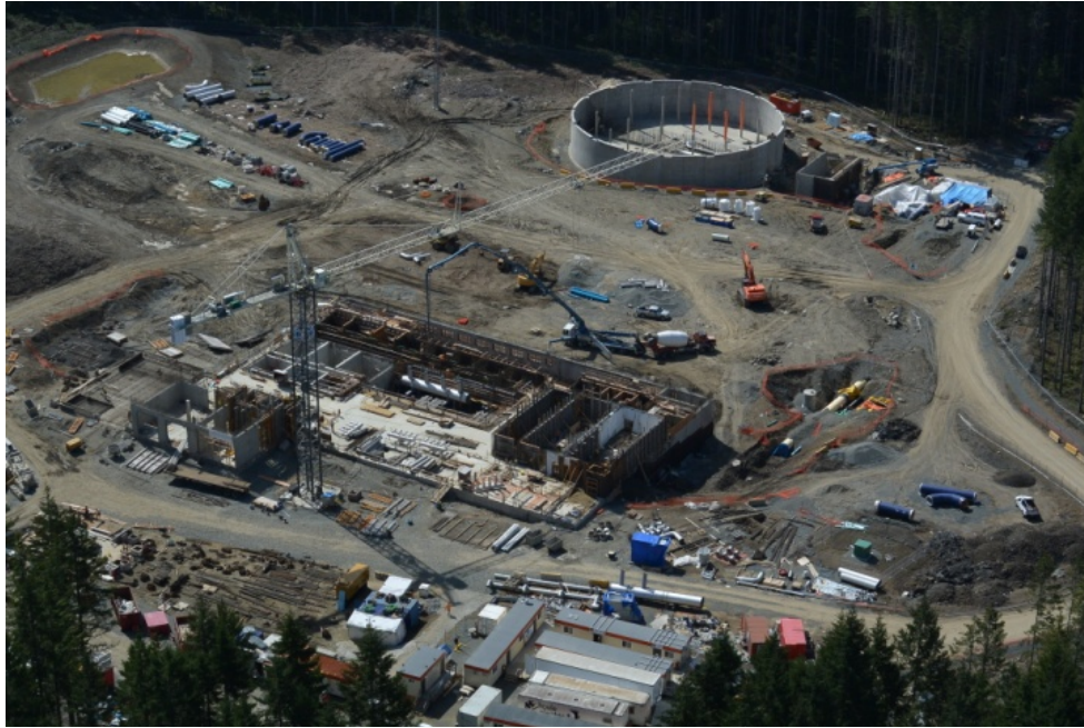
construction of the new water treatment plant building & clearwell tank - May 1, 2014

In January 2012, the City received notification of Federal funding under the Canada Gas Tax Fund towards the building of a new energy recovery building and an enclosed concrete water storage tank. The new 14 million litre drinking water storage tank replaces the existing open reservoir and improves treated water quality. Construction on this new tank commenced in March 2013 and was completed May 2014. Almost complete this facility provides storage for treated drinking water for just over 30% of the City residents covering an area from downtown to south Nanaimo and incorporates Snuneymuxw Reserves Nos. 1 and 2. The new tank will receive clean potable water from the new South Fork Water Treatment Plant in 2015.