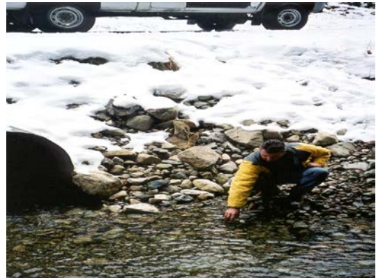
raw water sampling at a Jump Creek tributary

Under the British Columbia Drinking Water Protection Act all water purveyors are required to provide customers (the public) with an annual report on the quality of their drinking water. The City has compiled the following information to help you better understand your drinking water.