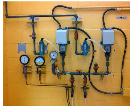
chlorine disinfection at Water Process Centre

Approximately 75% of the water reaches the customer by gravity. The City also operates several pump stations that are used to supply water to higher elevations in the City or boost pressures during peak flows. The pump stations and tanks also act to give the system a safety factor for fighting fires and redundancy for possible system failures.