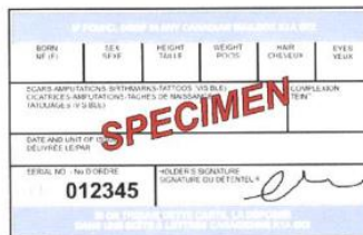
Temporary Identification Card NDI - 10 Carte d'identité temporaire NDI - 10