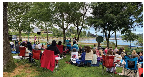
Act Theatre in Maffeo Sutton Park

To learn more about our Grants and to see the organizations, programming and events being supported by this program, please visit our Grants page on our website.