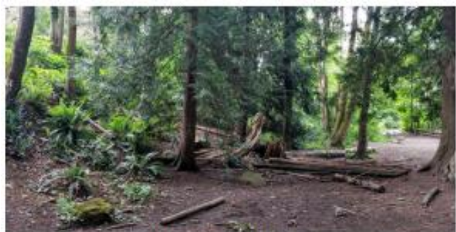
Forest understory at Woodstream Park.