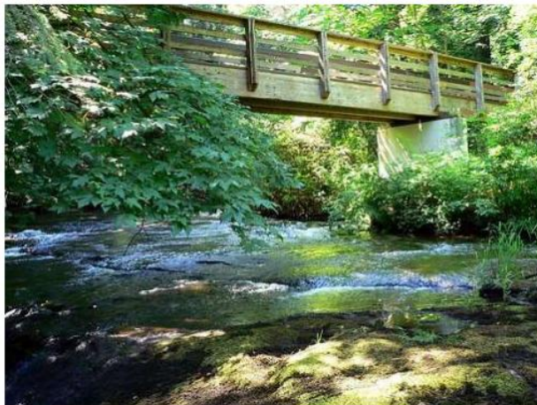
The Millstone River flowing through Bowen Park.

Applicants should plan to attend an online information session on February 10, 2026, at 5:00p.m. Please contact sustainability@nanaimo.ca to RSVP.