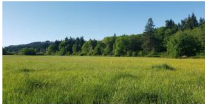
View across East Wellington Park.

Due to the integrated nature of natural assets, in addition to the green goals stated above, projects may also demonstrate connections to other City Plan goals such as active and healthy communities, empowerment and reconciliation. All projects should also support the "Environmental Responsibility" theme within City Plan, including projects that "will protect and enhance Nanaimo's natural environment by looking after the community's biological diversity and adapt the way we live, work, recreate, and move."