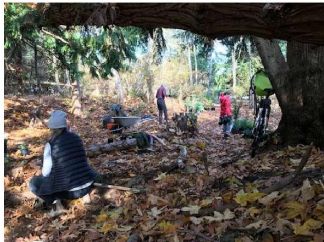
Volunteers hard at work along Walley Creek and Morningside Park.

If there was an error in the assessment process (for example, that support material was misplaced), applicants may file a formal complaint, in writing, within 10 calendar days of notification of results. All appeals will be reviewed by an appeals committee.