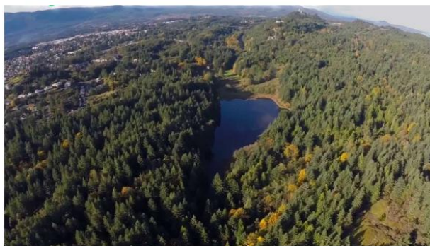
Linley Valley Park and the Cottle Creek watershed.

The City Plan recognizes the vital role of natural assets and green and blue spaces in the community. Urban tree canopies, natural areas, and greenways are a fundamental part of the city's infrastructure and provide many benefits. They provide wildlife habitat; ecological services, including stormwater management and air and water quality improvements; reduction of urban heat island effects and climate resiliency; human health and safety; and community livability.