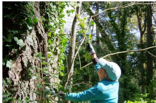
Volunteers removing invasive plants in Bowen Park.