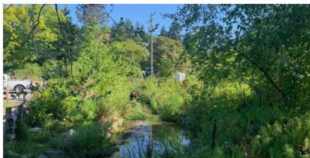
Daylighted section of Departure Creek at Departure Bay Centennial Park.