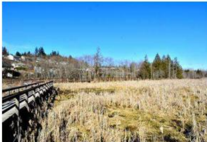
View of wetland and Richards Marsh Park.

Organizations and individuals applying for funding must be based in Nanaimo and/or be proposing a project that primarily serves Nanaimo residents. Eligible applicants include: