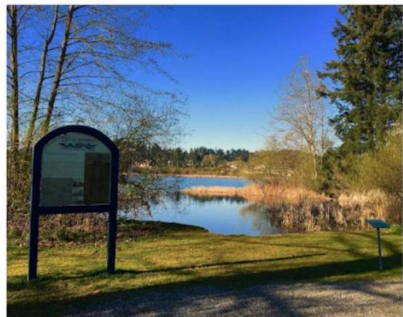
Main trailhead at Diver Lake Park.