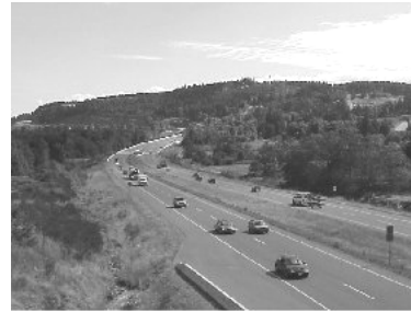
Plan Nanaimo discourages commercial and industrial development along the Nanaimo Parkway.

An Urban Containment Boundary provides a well defined boundary between areas of the City designated for urban growth and those protected for rural values, and where urban services (eg/ water, sewer) are available for development.