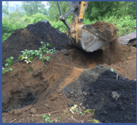
Extensive Remediation of Coal and Construction Waste