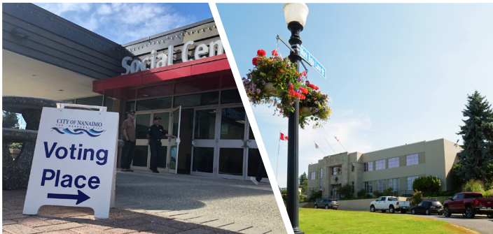
Beban Social Centre