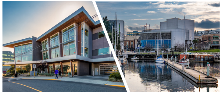
Service and Resource Building, 411 Dunsmuir Street A View of the Port Theatre from the harbour

Save the paper! With a MyCity account, you can change your billing notice preference to email. Simply go to mycity.nanaimo.ca , use the folio number and access code found on your tax notice to register. You can also have all your user rates bills emailed to you. Learn how you can set up your own MyCity account at www.nanaimo.ca/goto/MyCity .