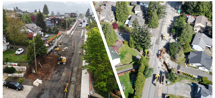
Third Street Complete Street construction

To stay up to date with these and other City construction projects, visit the Current Construction Projects page at www.nanaimo.ca/construction .