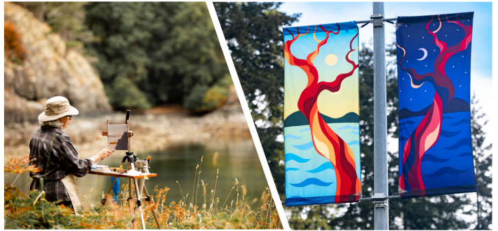
Capturing the beauty of Neck Point Park

You can create a drought-resistant yard with a few tweaks. Instead of grass, switch to less water-intensive options of clover or sedums. In the garden, plant drought-resistant plants such as kinnikinnick, salal, sword ferns, rockrose and lavender.