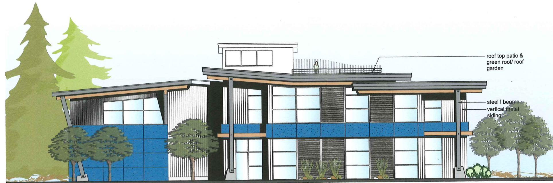
west elevation (lake front)