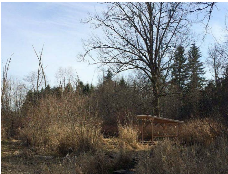
West Marsh Bird Banding Shed