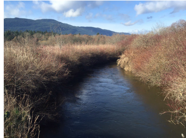
Millstone River with Riparian Vegetation (primarily Red Osier Dogwood)