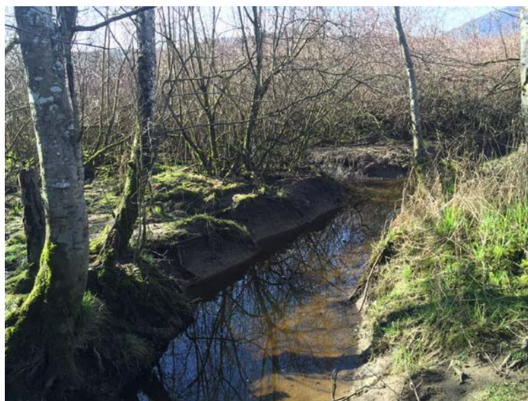
Ditch in West Marsh used for drainage by previous owner