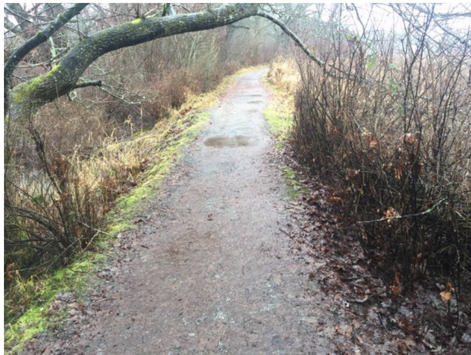
North Walking trail along the interface with the Millstone River Riparian Area