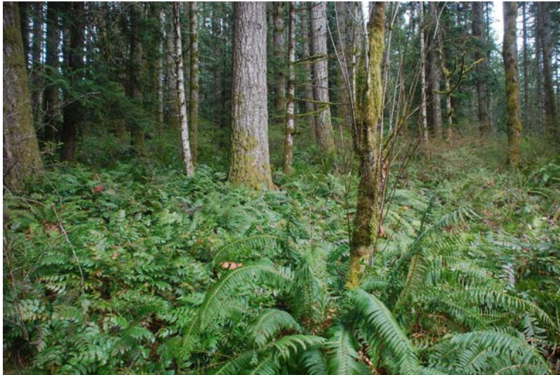
Upland area West Marsh (Douglas-Fir, Dull Oregon Grape and Sword Fern)