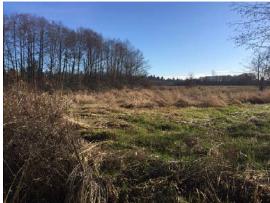
West Marsh – Former hay field with alder forest