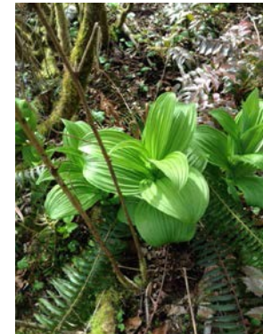
Indian Hellibore Veratrum viride