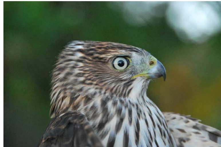
Immature Cooper's hawk