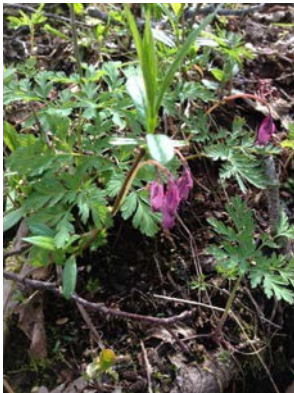
Pacific Bleeding Heart Dicentra formosa