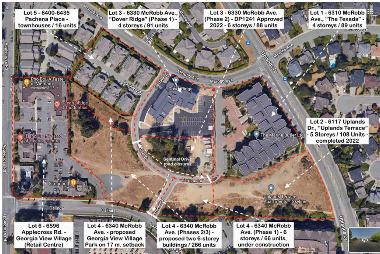
Figure 2 – Georgia View Village neighbourhood map (November 2023).

2.2.2 The specific neighbourhood where 6340 McRobb is located is called Georgia View Village, in which a small commercial centre by the same name is located on its western border. In addition to these two properties, there are four other residential properties in the neighbourhood (see map of Georgia View Village in Figure 2 below).