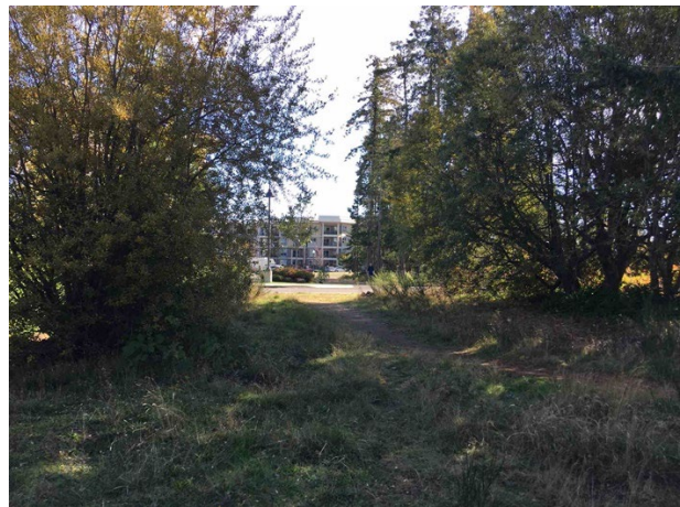
Figures 3 & 4 – 17 m. setback on northern border of 6340 McRobb Ave., western end (left) and eastern end (right).