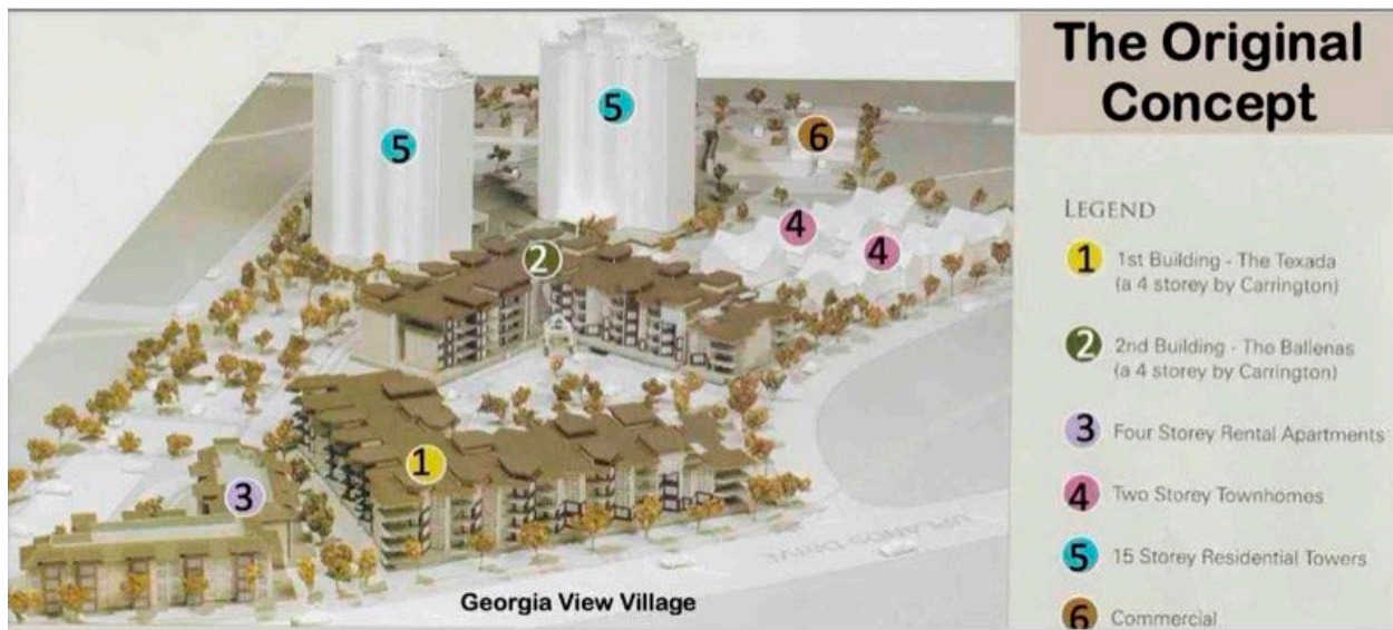
Figure 7 – The original development concept for Georgia View Village.

2.5.1 The original concept for Georgia View Village comprised six properties (see Figure 7 above): The Texada at 6310 McRobb Ave. (4-storeys as it now exists); Texada’s mirror image, The Ballenas, at 6330 McRobb Ave. (now the 4-storey Dover Ridge and an approved 6-storey future building there); a 4-storey building at 6117 Uplands Dr. (now the 5-storey Uplands Terrace); the Pacific Place townhomes on Pachena Place (as they now exist); an open green space (which could have been used for a park) at what is now Phase