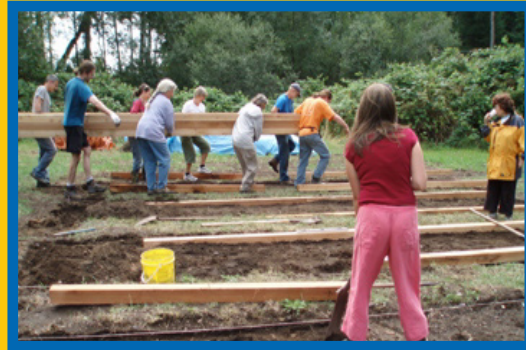
DIGS volunteers building the community garden on Protection Island.

The DIGS group will be celebrating their Grand Opening and one year anniversary on May 25 from 2-5 pm. Everyone is invited to attend, and the day will include lots of fun activities for all ages, including live music, a baked goods sale, ribbon cutting, a plant and swap sale, a petting zoo, refreshments and more! This is a great opportunity to gather, to learn about the garden and to see how far it has come since its beginning. The event is also a fundraiser so they can continue to move forward into full spring/summer production.