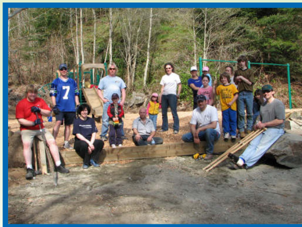
All the happy volunteers at Robin’s Den Park.