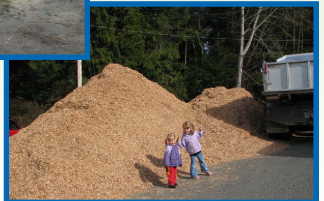
Wood fibre safety surfacing before it was installed at the playground.