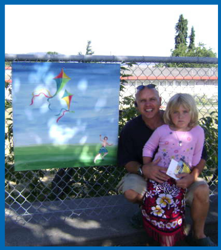
Two south end volunteers pose beside the newly painted placards on the fence of Deverill Square Park. The art work brightens up the neighbourhood and has proven to be a great success!

A public art display was launched on August 24, 2007 at Deverill Square Park (located between Haliburton and Irwin Streets). The display features paintings donated by 25 local artists permanently mounted on the fence around the park. The theme of the paintings is “At Play” and reflects the growing use of the park as a community play space for residents of the South End. This event was sponsored by the South End Community Association and the City of Nanaimo as part of the initial phase of an improvement program for the park. Support for this project has been provided by the Nanaimo Recycling Exchange, Habitat for Humanity, Slegg Lumber, the City of Nanaimo, Lighthouse Residential Services, as well as the local artists who have generously donated their work.