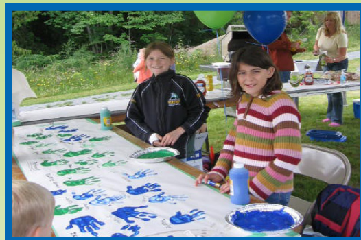
Having fun at the Country Hills Park grand opening.

A park party was held on June 24, 2007 in the park to celebrate the grand opening of Country Hills Park in Chase River. This park was developed by neighbourhood volunteers and many donors in 2006. The park and playground is very well used by the many neighbourhood families. Woodgrove Centre, a major park sponsor, helped to host the park party. More work is scheduled to continue at Country Hills Park this fall including the installation of a split rail fence and park irrigation system.