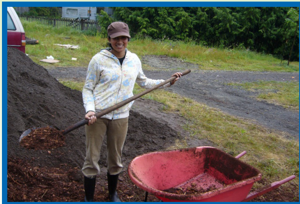
A volunteer spreads bark mulch at the work party for the Beaufort Park Community Gardens.

An exciting idea for a community garden was submitted to the Parks Recreation and Culture Commission from the Nanaimo Montessori School in 2005. This idea was incorporated into an improvement plan for Beaufort Park, and due to the efforts of many volunteers, has grown into a productive and beautiful green space. Located off Waddington Road in Beaufort Park (right behind the Nanaimo Montessori School), the gardens are tended by enthusiastic neighbourhood gardeners and diligent Montessori Students. The gardens are well connected to the rest of the 10 acres of park through a new trail system. There are plans to continue expanding these gardens in the years to come, including about 10 new beds for Spring 2008!