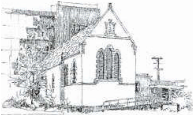
St. Paul's Anglican Church, 100 Chapel Street

in 1852 by two French Canadian axemen, it has served as a jail, a store, a clubhouse, a museum, and most recently, an interpretative centre.