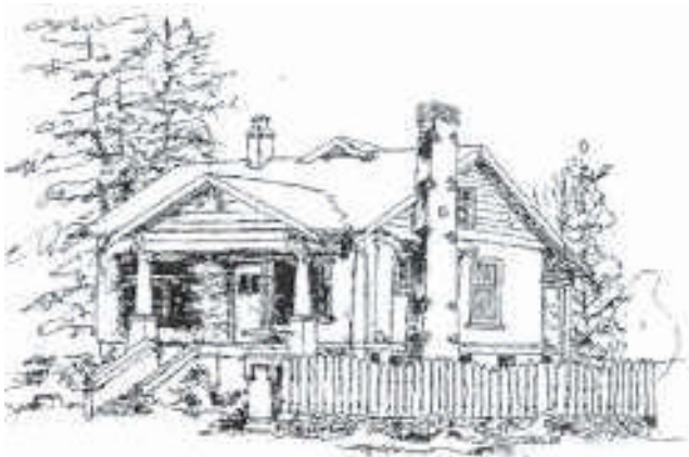
Beck Residence, 610 Selby Street (Craftsman)

Philosophically, the Craftsman style is based on the British Arts and Crafts movement of the 1860s. Founded by William Morris (1834-96), the Arts and Crafts style was noted for its rejection of the pretentious and often overdone decoration of 19th century classical and revival styles. Morris and his followers wanted to achieve a hand-crafted style that honestly reflected local culture and materials. Thus, Arts and Crafts architecture looked back to the simplicity of medieval building techniques and designs. Based on the medieval English cottage, house designs were rambling, asymmetrical formations that proudly displayed supporting timbers, brick work and thatched roofing.