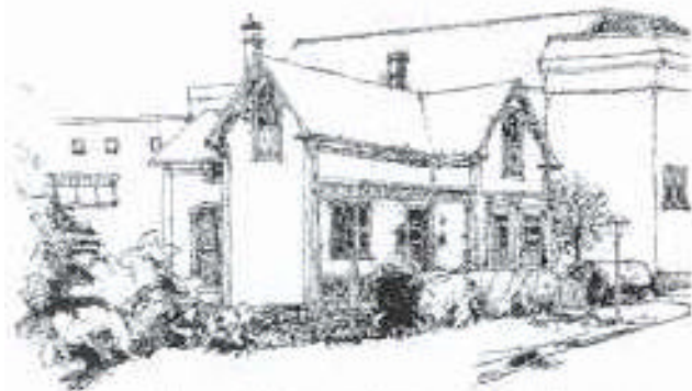
Harris Residence, 375 Franklyn Street (Late Victorian)

For housing style, builders and owners looked to Britain, eastern Canada and, in the early 20th century, to the United States. Building designs, specially for middle-class homes, were rarely produced by individual architects. Rather, the owners and builders found guidance in plan books, catalogues and building journals. One journal, The Builder , published in England as early as 1842, provided the most current British designs and floor plans. Canadians published their own interpretations of the current styles in The Canadian Architect and Builder , which began printing in Toronto in 1888. For lower-income homeowners and the "do-it-yourselfer", whole house kits could be ordered from the Eaton's catalogue or direct from companies such as British Columbia Mills Timber and Trading Company. The packages claimed to include all materials, from finishes to much needed instructions.