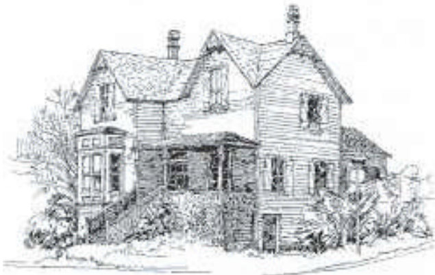
Young Residence, 102 Fry (Late Victorian)

The Edwardian style, popular from about 1898 to 1910, is recognized for its simplicity and balance compared to the sometimes over complicated look of Victorian architecture. Less complex and decorative, this style tends towards a more symmetrical and classical appearance as in the Schetky Residence (225 Vancouver Avenue), Rowe Residence (545 Haliburton Street) and the Residence at 467 Eighth Street .