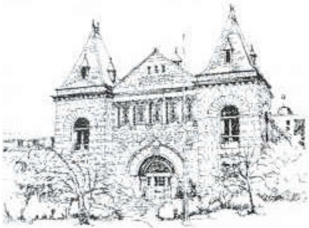
Nanaimo Courthouse, 31-35 Front Street (Richardsonian Romanesque)

The strength and stability of Nanaimo are also felt in the design of Fire Hall #2 (34 Nicol Street), the Courthouse (31-35 Front Street) and the Bank of Commerce, now the Great National Land Building (5-17 Church Street). All three buildings are designed with a monumental sense of authority typical of British architecture. The brick firehall adopts the crenellated features of a castle or battlement. The large rusticated arches and stone construction of the courthouse give it visual weight and solidity. The colossal temple porch of the Bank emphasizes the power and might of the classical past.