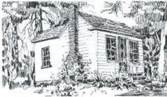
Roughbottom Residence, 100 Cameron Road - (Miner's Cottage)

The town plan was the initial step towards Nanaimo's eventual incorporation in 1874. Once the plan was developed in 1864, the company auctioned off city lots. The new owners were the entrepreneurs, business owners, mine bosses and investors in Victoria who must have felt that Nanaimo had a future. Later, mine workers, living in company-owned houses, were offered five acre farms in the area west of the town. Purchased on a rent-to-own basis, the farms provided the miner's family with land to build a home and a means of supplementing their incomes which was especially important during the frequent mine layoffs. Many of the original farm homes, now surrounded by modern housing, may still be seen in Harewood neighbourhoods. The Newbury Farm House at 678-696 Second Street is a good example. Only one farm, the "Five Acre" Farm at 3rd Street and Howard Avenue (560 Third Street), remains undeveloped. Here, in the midst of suburban Nanaimo, we can enjoy the sights of cows grazing in a pasture.