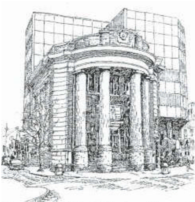
Great National Land Building, 5-17 Church Street (Classic Revival)

The strength and stability of Nanaimo are also felt in the design of Fire Hall #2 (34 Nicol Street), the Courthouse (31-35 Front Street) and the Bank of Commerce, now the Great National Land Building (5-17 Church Street). All three buildings are designed with a monumental sense of authority typical of British architecture. The brick firehall adopts the crenellated features of a castle or battlement. The large rusticated arches and stone construction of the courthouse give it visual weight and solidity. The colossal temple porch of the Bank emphasizes the power and might of the classical past.