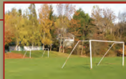
11 620 Park Avenue