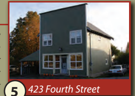
5 423 Fourth Street

Built around 1910, the Fourth Street Store represents a type of building that was once common throughout the city. It is an excellent example of a simple, vernacular Boomtown or False-Front style structure. This building is the most intact early commercial-residential building in the Harewood area.