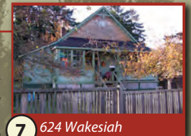
7 624 Wakesiah

Frederick Crewe, a miner, is listed as living at this site as early as 1900. It is likely this home dates from approximately that time. A concrete milk house remains on the Wakesiah Avenue side of the property, and the concrete foundations of a barn exist on the adjacent lot to the south, recalling the agricultural legacy of the area.