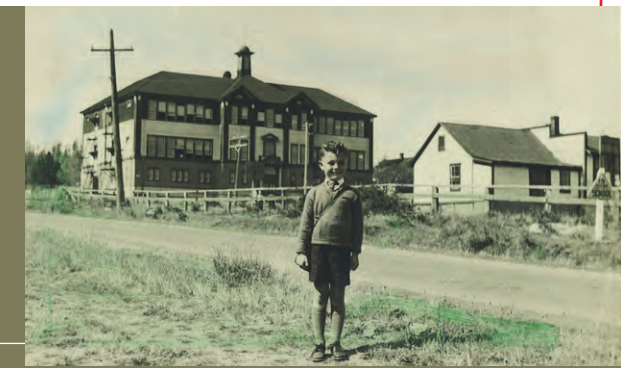
Harewood School, ca 1940

Established in 1892, the Company Farm provided fodder and pasture for the mules and horses that worked underground hauling coal cars in the local mines.