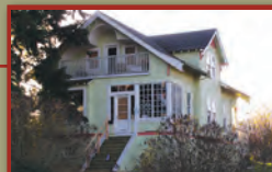
12 465 Park Avenue

Built around 1913, the house is very similar to buildings at 746 Railway Avenue, 648 and 650 Haliburton Street and was likely built by the same builder. The sophisticated design includes battered foundation skirting and an unusual scalloped inset arch over the second floor front and rear balconies. This house was built on a lot subdivided as part of the "Brookside" Subdivision in 1912.