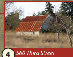
4 560 Third Street

This farm is exceptionally important as the only recognized, intact acreage in one of British Columbia's earliest planned communities. The farm, including the acreage, house, barn, outbuildings and orchards, stands in stark contrast to the small city lots that surround it in an area that, over time, has lost much of its original rural character.