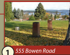
1 555 Bowen Road

The Nanaimo Public Cemetery was established in 1877. The modest early grave markers reflect Nanaimo's predominantly working-class population while more elaborate monuments provide the names of the city's wealthier citizens. The many inscriptions about mine accidents, testimony to the over 600 mine-related deaths that occurred from the 1860's to the 1950's, are representative of Nanaimo's history.