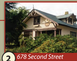
2 678 Second Street