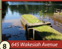
8 645 Wakesiah Avenue

Built in 1910 by the Western Fuel Company to supply water for coal washing and for use by miners, mules and horses in the mines, the Colliery Dam water system quickly developed an important secondary use. Homes near the pipeline were allowed to tap the line for domestic uses and eventually this water was carried to most of the homes in South Harewood.