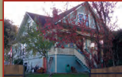
9 467 Eighth Street

This residence, built around 1912, is a very good example of an Edwardian farmhouse. The building's solid appearance and minimal decoration reflect the era's move away from the ornamental excesses of the Victorian era.