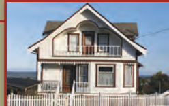
10 746 Railway Avenue

Built around 1912, the house is a very good example of an eclectic Edwardian era design. Its highly refined details include a bellcast roofline, a central corbelled chimney, a stained glass transom in the front bay and a very distinctive scalloped inset arch over the second floor balcony.