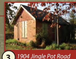
3 1904 Jingle Pot Road

The cottage was built as a coal company office around 1910. Although East Wellington was known as a brick and tile manufacturing area, brick was seldom used in residential work. Originally set on a large lot at the corner of Addison Road, the cottage was purchased from the Specogna family in 1998 and relocated to this site for use as an historical and environmental interpretation centre.