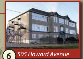
6 505 Howard Avenue