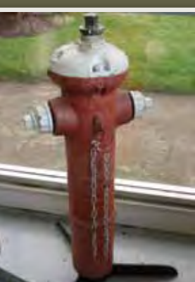
Early Nanaimo fire hydrant

This beautifully restored fire truck (now located at Fire Station No.1 – 666 Fitzwilliam Street) was one of two motorized rigs purchased by the City of Nanaimo in 1913 to replace their horse-drawn apparatus. It is a Type #10, No. 189, built by the American LaFrance Fire Engine Company of Elmira, New York. The Department's collection includes a number of other heritage artifacts, such as a massive solid brass fire bell, cast in 1874 by the Buckeye Bell Foundry of Van Duzen & Tift, Cincinnati, Ohio, an old hose reel, early fire hydrants, and other fire-fighting paraphernalia.