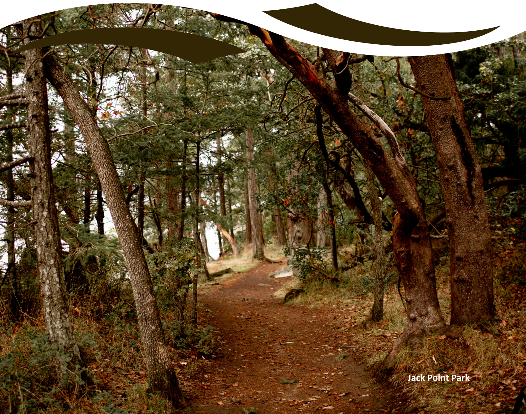
Jack Point Park