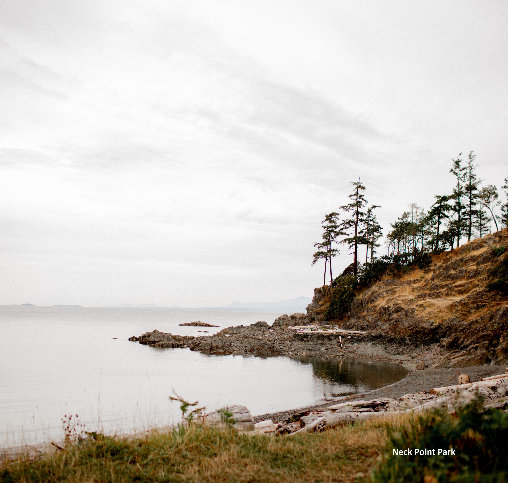
Neck Point Park