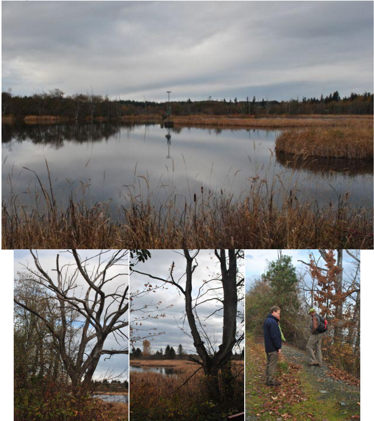
Figure 4. Top: east ward look of potential basking log site; Bottom: left & middle- potential basking logs right- Known breeding ground along dike

Photos from visit on 17 Nov 2011 taken by Trudy Chatwin: