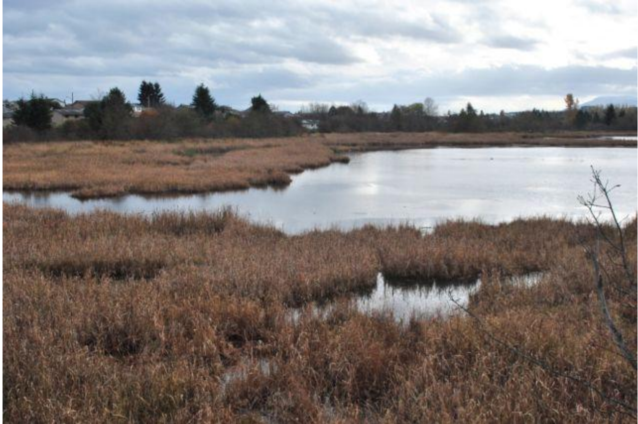
Figure 5. Top left –Turtle nest attempt on dike, middle – cut windfalls in north end, right- previous nest site enhancement site; Bottom – potential basking log site in north end of marsh.