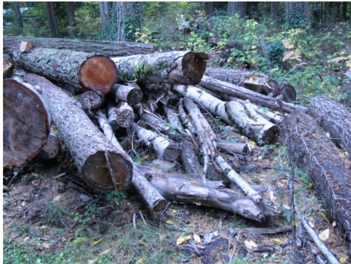
Figure 3. Logs available for basking logs at Westwood Lake