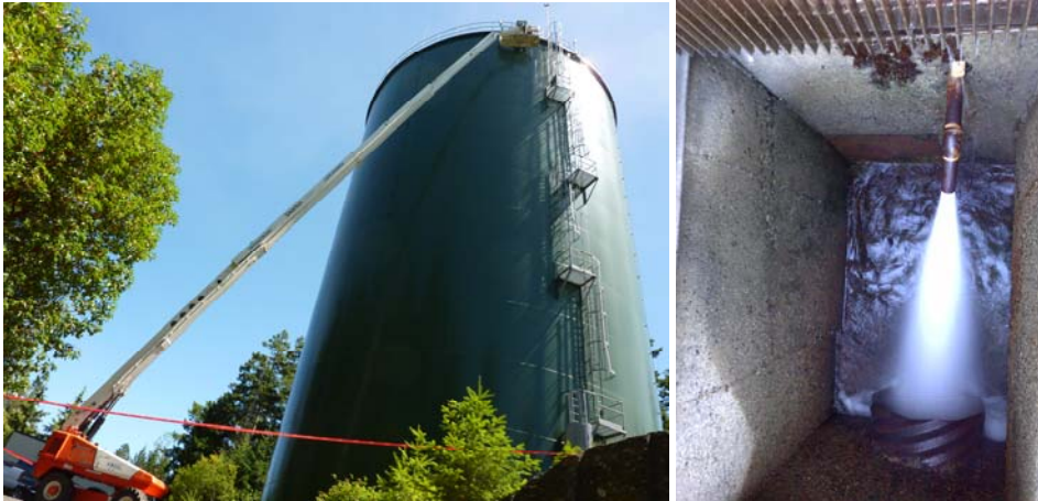
Figure 2-2: Photos of Duke Point Reservoir and Blow-Off